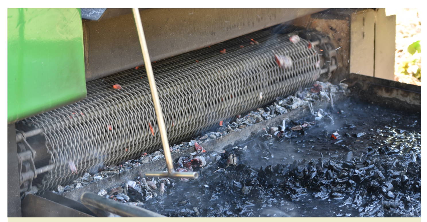
For land managers seeking solutions for implementing grassland restoration projects and hazardous fuels reduction projects, biochar is a promising product that can be the cornerstone of an organic matter redistribution system. In this photo, biochar is produced by the CharBoss, a mobile biochar processing air curtain burner.

This "A-Z guide" highlights recent Rocky Mountain Research Station (RMRS) science and covers methods to make biochar on site, including using piles, kilns, and air curtain burners. It also details three uses for biochar (agricultural, forest restoration, and mine land reclamation), and methods for application, including biochar spreaders.