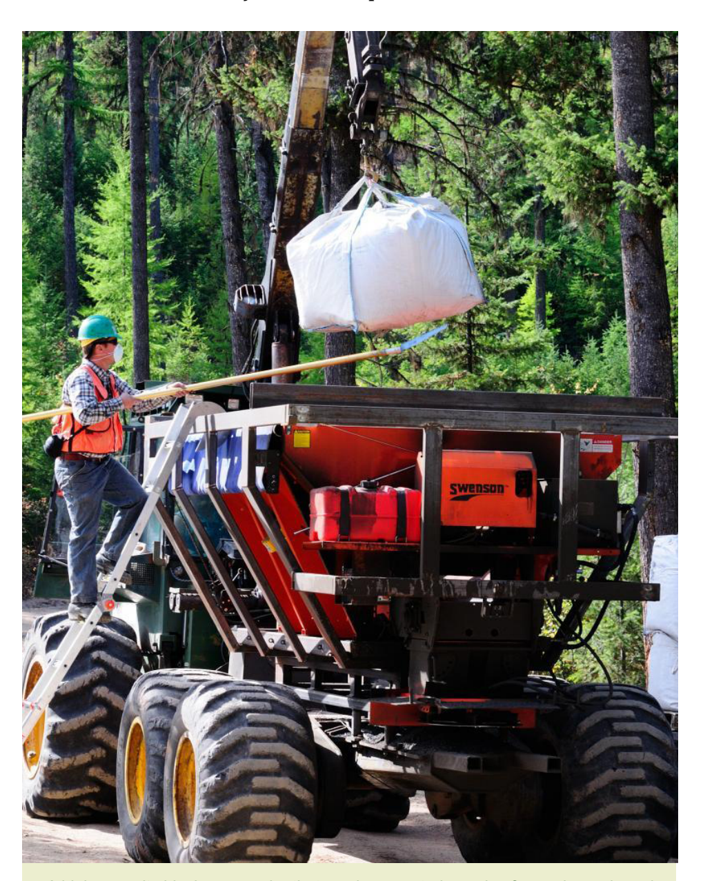
A high-capacity biochar spreader that can be mounted on a log forwarder and used on skid trails and log landings to distribute biochar has been developed by RMRS scientists and the Missoula Technology and Development Center.

be applied in increments, so that the soil is not "overloaded" with biochar. Therefore, one application may not be sufficient when mixed with the residual soil during mine land restoration, but soil and biochar testing will determine sitespecific needs.