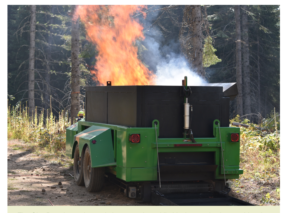
The CharBoss is an air curtain burner-style mobile biochar production machine that can consume material from most burn piles with minimal to no preparation.