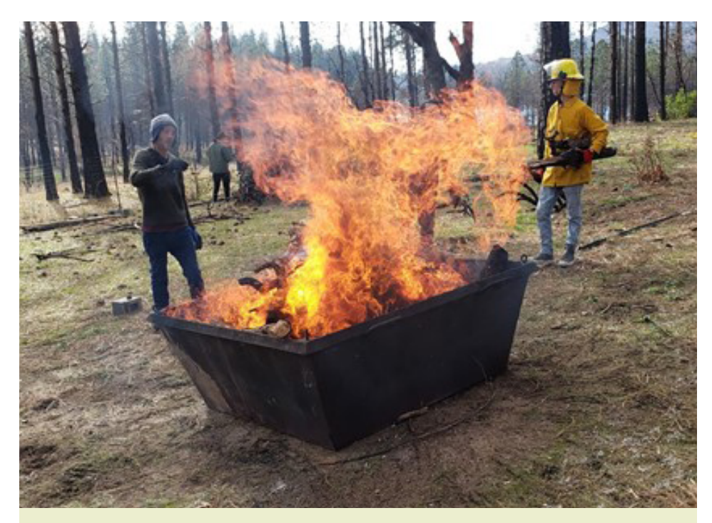
When open burning in kilns or slash piles, keeping a flame cap across the top of the burning material will reduce smoke and particulates.

Air curtain burners, also called air curtain incinerators or fireboxes, are another method for onsite biochar production. Page-Dumroese, Forest Service managers, and the U.S. Biochar Initiative worked with Air Burner Inc. to innovate ways to create useful biochar from woody biomass by using the air burner concept. The team was recently awarded a patent for their mobile biochar production system designed for their air curtain burner. The new system is called the CharBoss. Page-Dumroese says, "Mobile processing of woody residues into