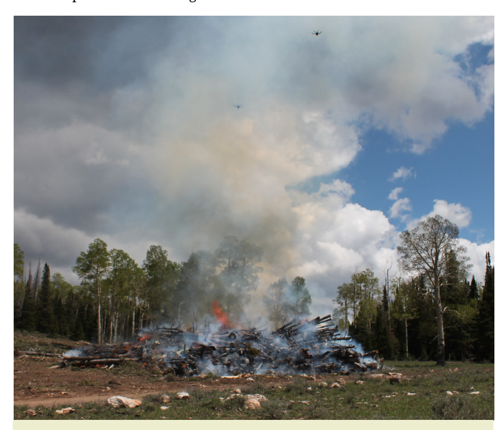
Traditional slash pile burning can damage soil, leading to a need for follow-up site rehabilitation. New, alternative biomass removal options like changing the way slash piles are constructed can prevent damage and create beneficial biochar in the process.

Scientists Debbie Page-Dumroese (from the Rocky Mountain Research Station) and Matt Busse (from the Pacific Southwest Research Station) collaborated with Forest Service managers from the Pacific Northwest Region, including woody biomass coordinator Jim Archuleta and air quality specialist Rick Graw, to develop an alternative method for building slash piles. Their goals were to reduce the amount, extent, and duration of soil impacts from burning and to create more charcoal for use in soil