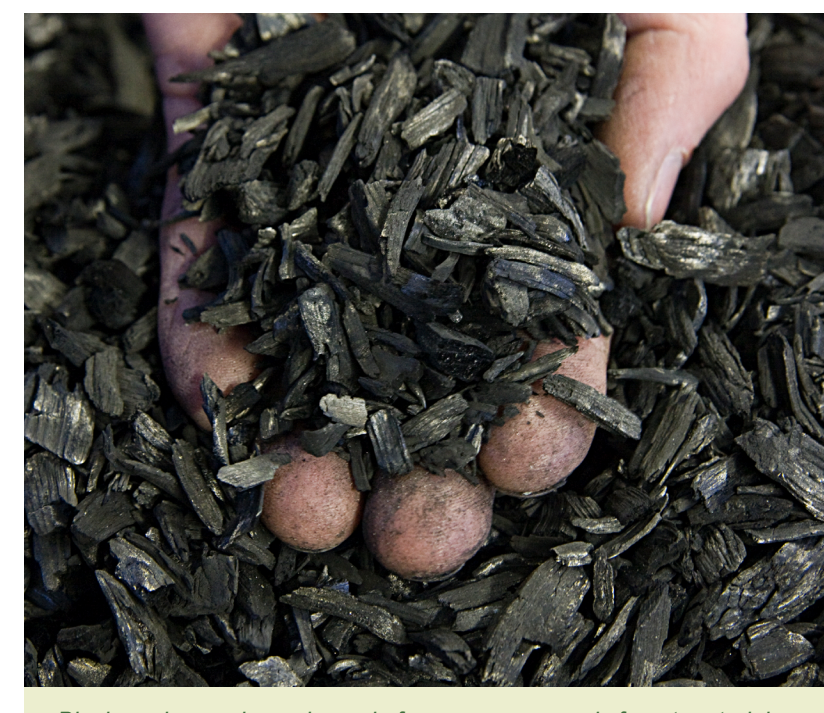
Biochar, shown above, is made from excess organic forest material and is proving to be a valuable economical and environmental resource.

By turning excess forest organic material into economically and environmentally valuable biochar, managers can redistribute the beneficial properties of the organic material from overgrown and unhealthy forests to soils in need of restoration. This process is a key piece of the restoration-economics puzzle. Rocky Mountain Research Station senior scientist Debbie Page-Dumroese says, "Creating a value-added product (biochar) from woody residues that are not valued can provide an economic return to landowners or entrepreneurs." Rocky Mountain Research Station Research Economist Dan McCollum's research shows, "Further, this can change the economics of forest treatments, such as thinning and fuel reduction